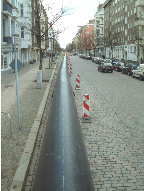
PE Pipe ready for Swagelining operation.