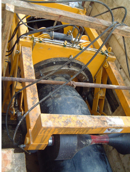
Nose Cone enters Swagelining Rig.