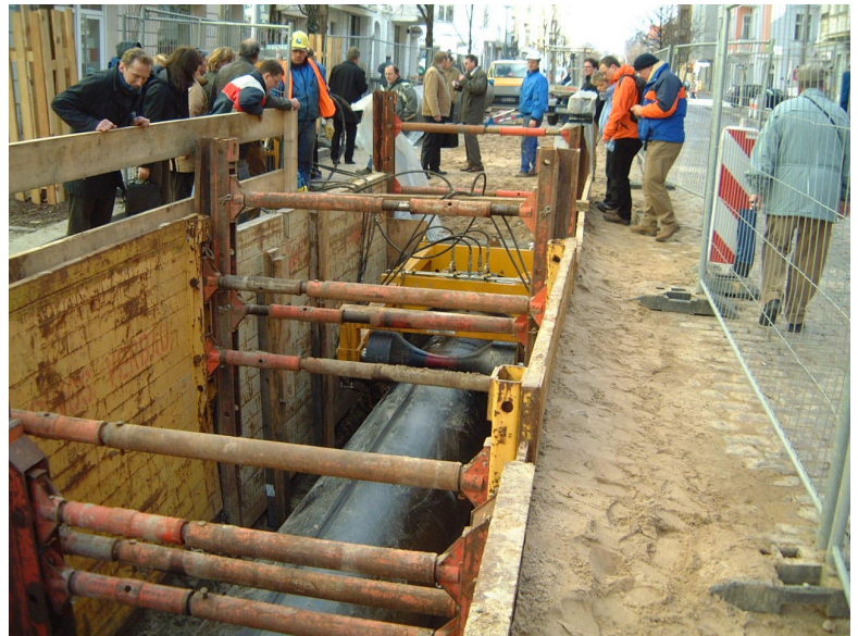
Swagelining Rig in action.