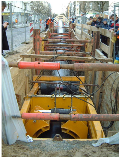
Swagelining Rig in action.