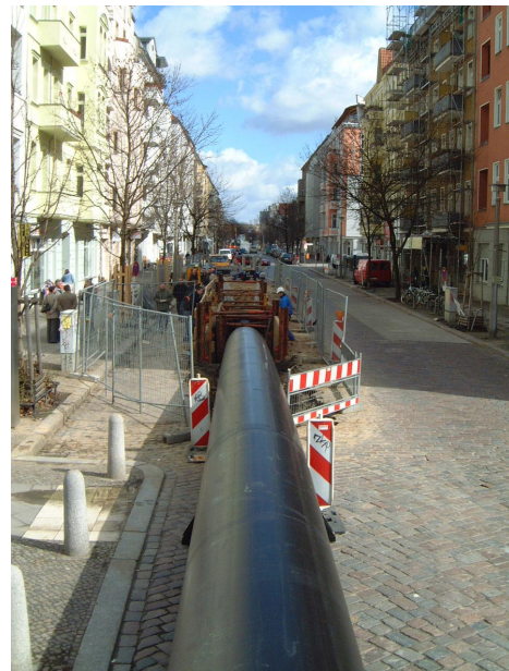
PE Pipe enters insertion pit.

The company follow a policy of continuous product development and as such reserves the right to make alterations to equipment and techniques without prior notice.