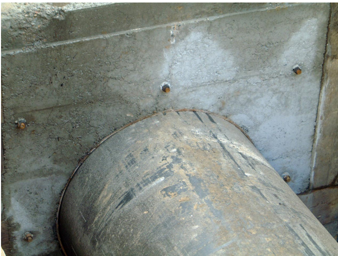
PE Pipe after reversion.