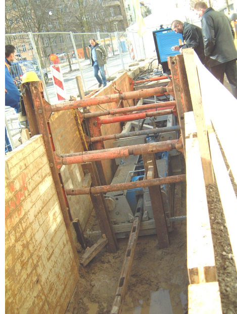
Rod Winch during Swagelining operation.